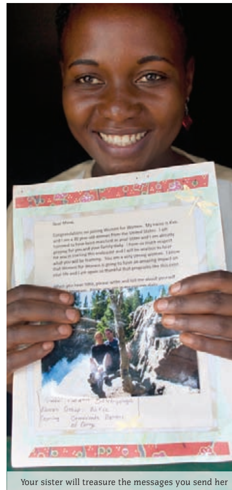
Your sister will treasure the messages you send her

Your sister will be encouraged to respond to the messages she receives from you, however some of the women in our programmes may have circumstances that make it difficult to write. For example, they may be suffering from post-traumatic stress disorder or they may not know how to write. We encourage you to continue sending messages to your sister even if she is unable to respond, because we know from experience that receiving messages from sponsors is an incredible source of support, comfort and inspiration to the women we serve.