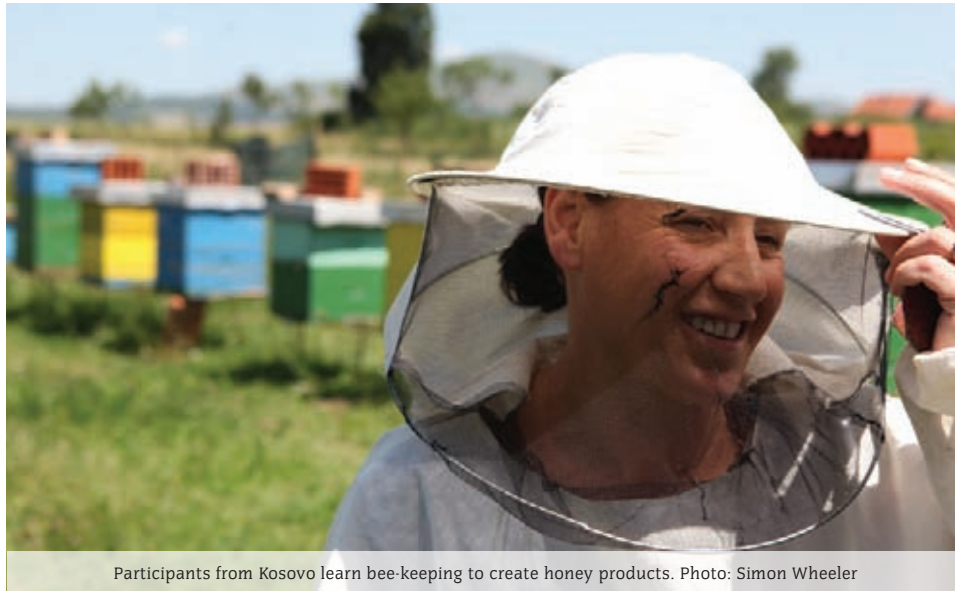
Participants from Kosovo learn bee-keeping to create honey products.

Our goal for your sister is for her to graduate from the programme with the ability to provide for herself and contribute to her family's income. The programme will teach her skills that she can use for income generation - skills